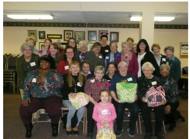
The packing team from the Feb. 9 Packing Party