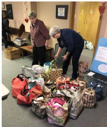
The finished totes ready to be packed in lockers