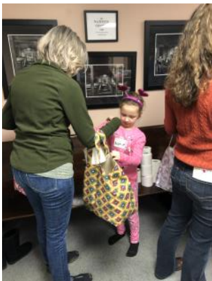
An 8-year-old volunteer helping out by putting toilet paper in the totes