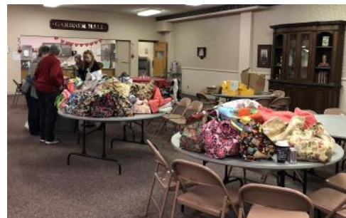
Some of the partially packed totes ready for writing packs to be inserted