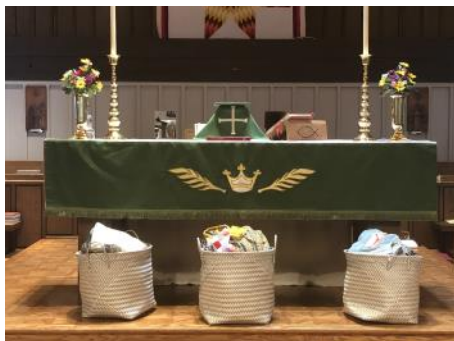
The generosity of our parishioners

Thank you to everyone who brought items recently for the ingathering for the New Beginnings project of The Friends of Tamar. Your donations of sleep shirts, towels/washcloths, socks, hand-made tote bags, Neosporin, pain reliever, hand sanitizer, and other various items were delivered to Trinity Cathedral on Feb. 9 and will be used at the next Packing Party. More than 300 tote bags filled with needed items were given to survivors of abuse in the Omaha area in 2018, and 400 are expected to be distributed this year.